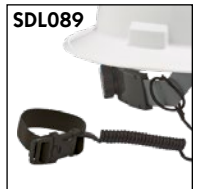
Hard hat not included